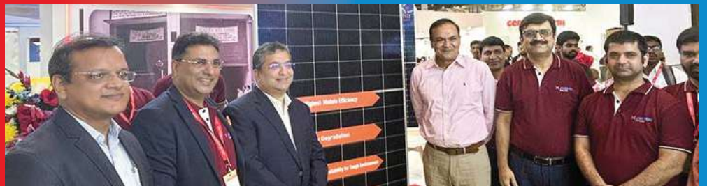
Launch of Helia NXT-R