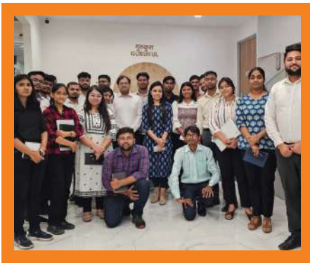
Big Picture Thinking Learning Enablers