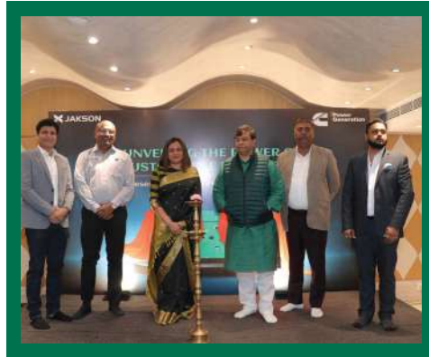
Kanpur, Uttar Pradesh