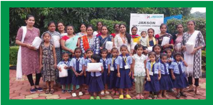
Celebrated the International Day of Elderly Persons at Angan Old Age Home, Noida