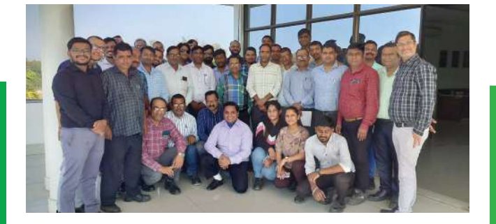
CSR Workshop at Kalsar Plant