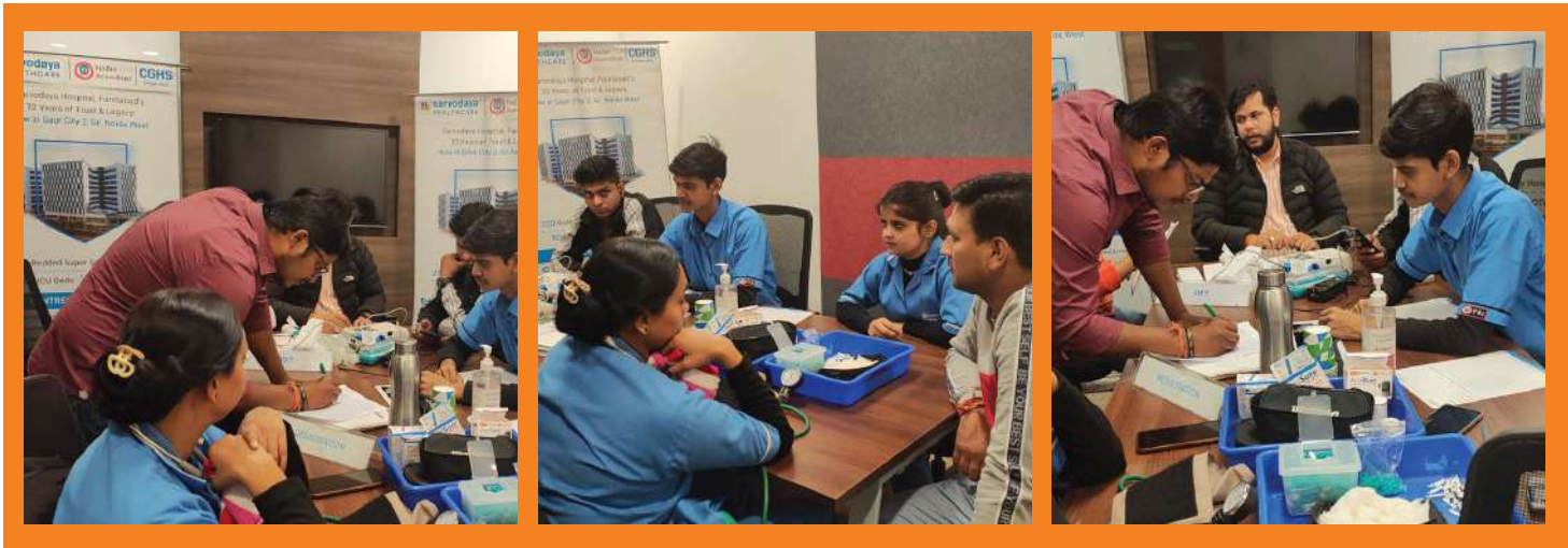
Health Check-up Camp in Noida-HO