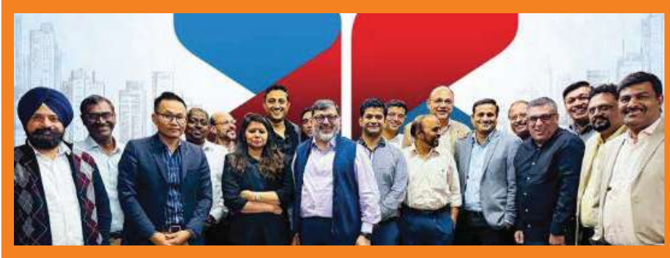
Introducing our Leadership Excellence Program (LEP), a 3-month journey of growth and empowerment