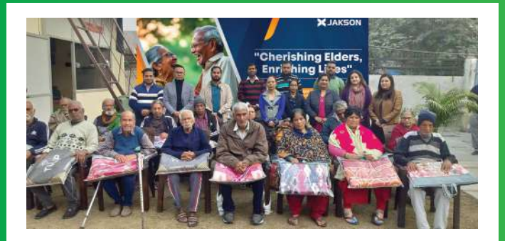
Joy of Giving Celebration at Angan Old Age Home, Noida