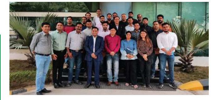
CSR Workshop at Greater Noida Plant