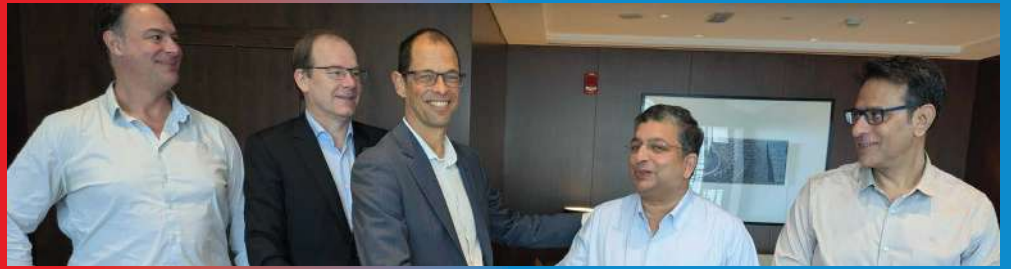
Water Desalination Revolution