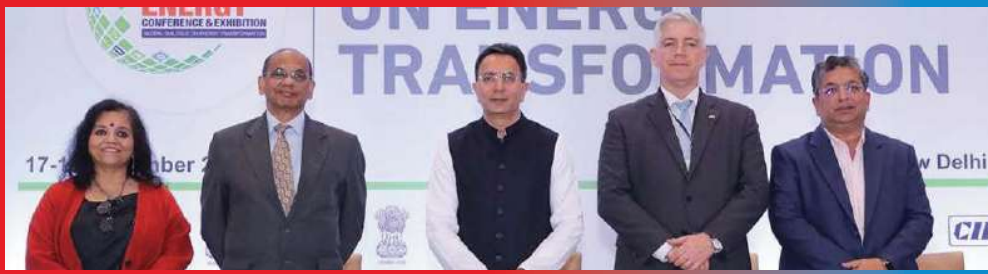
International Energy Conference 2024