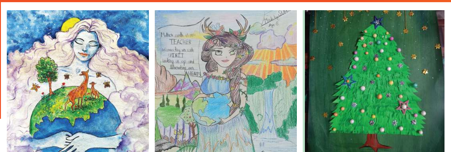
Children's Day Painting Competition