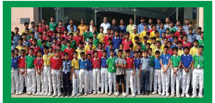
Environment Awareness Program for School Students, Noida & Greater Noida