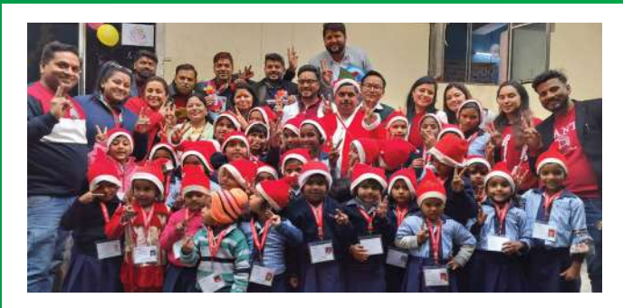
Celebration at Early Learning Centre Kasa, Greater Noida