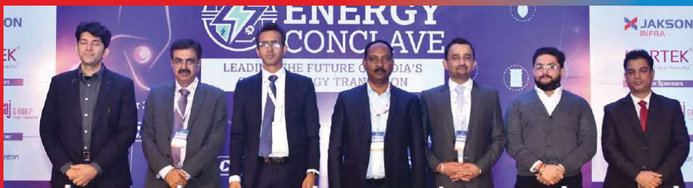
CII-NR Energy Conclave