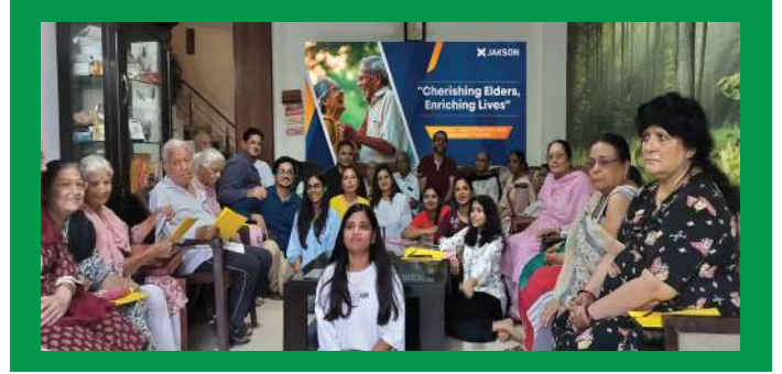
Celebrated the International Day of Elderly Persons at Angan Old Age Home, Noida