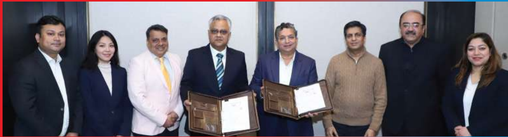
50 MWp Solar Rooftop Project