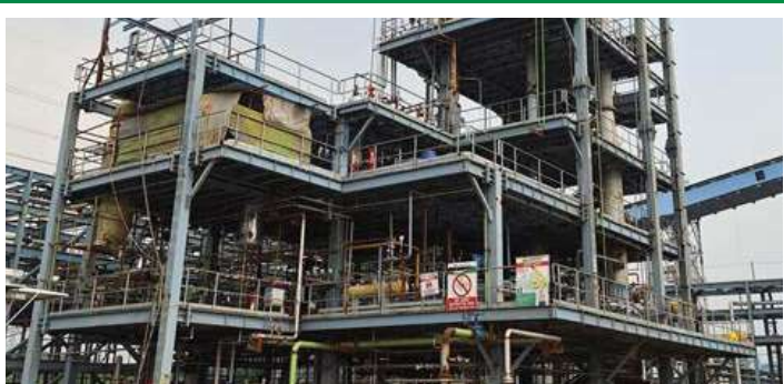
Successful synthesis of Methanol The project executed on turnkey basis at NTPC's Vindhyachal thermal power plant in Madhya Pradesh captures CO 2 directly from the flue gas emissions and converts it into methanol