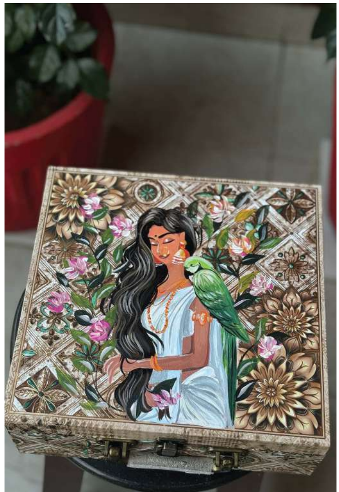
Jaishree Yadav Litigation & Corporate Affairs

From trash to treasure! Upcycled this gorgeous dry fruit box into a unique storage for my fav. collectibles