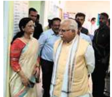
Hon'ble Minister of Power, Shri Manohar Lal Khattar, visited the NTPC Andaman O&M project site