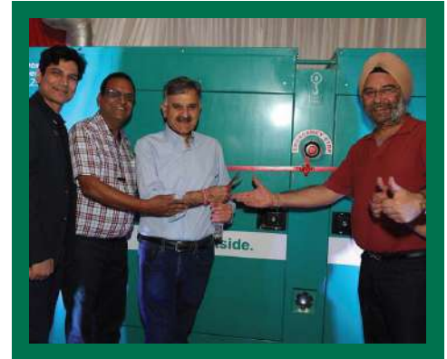
Agra, Uttar Pradesh