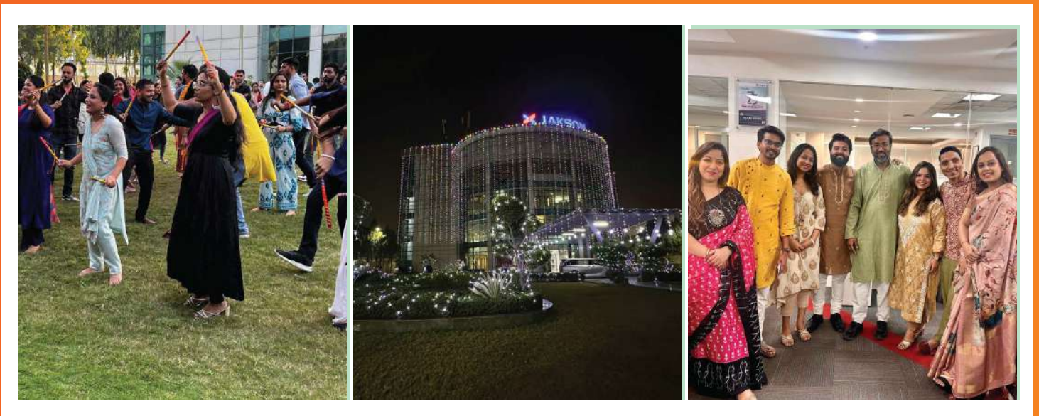
Diwali and Navaratri Celebrations at Jakson