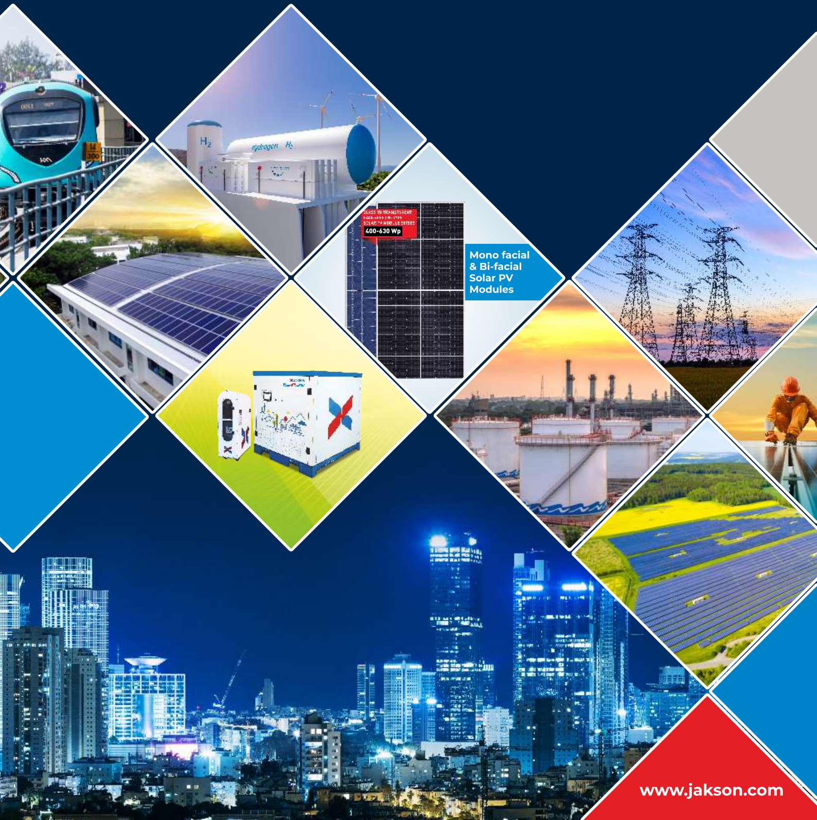
Mono facial & Bi-facial Solar PV Modules

DISTRIBUTED ENERGY | SOLAR | GREEN ENERGY | INFRA | BIOFUELS